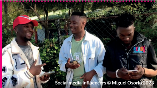
Social media influencers

BY MIGUEL OSÓRIO, PROGRAMME COORDINATOR MOZAMBIQUE: READY FOR AN AIDS FREE FUTURE